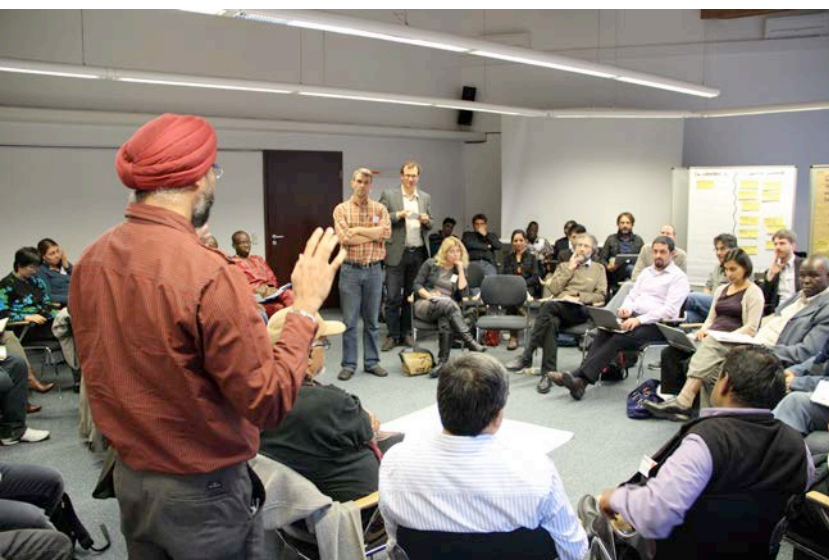
Impressions from the discussions on Nov 3rd