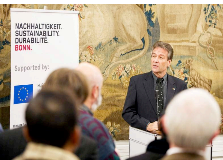
Mayor Jürgen Nimptsch at the Reception in the Old Town Hall, Bonn

The world café, after the first meeting of the working groups (see below), served as an opportunity for the participants to join and discuss the respective outcome of their group with members of other groups. In addition the knowledge café provided a space for an open and creative conversation about the state of the discussion and as a possibility to recap the first conference day. During the café, everyone was asked to write down their personal view or feedback on the course of the first day. These notes were collected and evaluated afterwards by the conference staff.