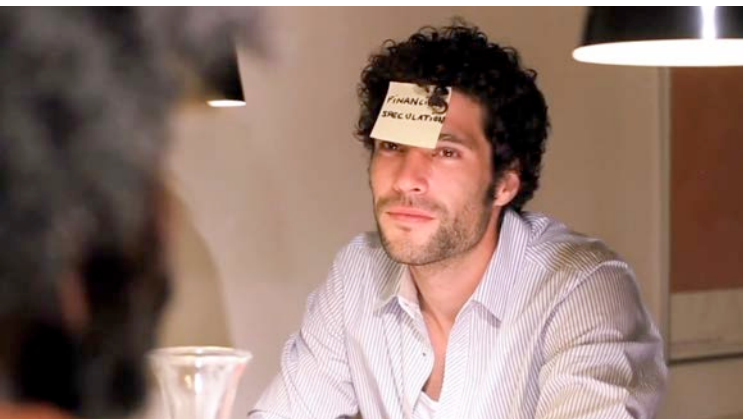
The Short Film: "What am I?" http://youtu.be/nmfODo0Q7Ho