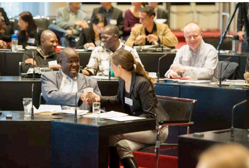
First interaction of conference participants

people. At the same time, the increasing energy demand is also threatening the people's access to food. To illustrate this, Santarius talked about a big Indian mining company which is also polluting the fields of local farmers. He pointed out that the time for a solo-mentality is definitely over, since neither climate nor energy nor agricultural strategies can be developed in a nimbus. In fact, a more systemic approach is needed. Civil society actors therefore have to think about their work and create strategies that take into account this interconnectedness and are more holistic and efficient - otherwise new "Copenhagens" will occur. He encouraged the audience to form strong alliances and create efficient strategies and campaigns to build up a strong resistance against the tremendous financial and political power of corporations 1 .