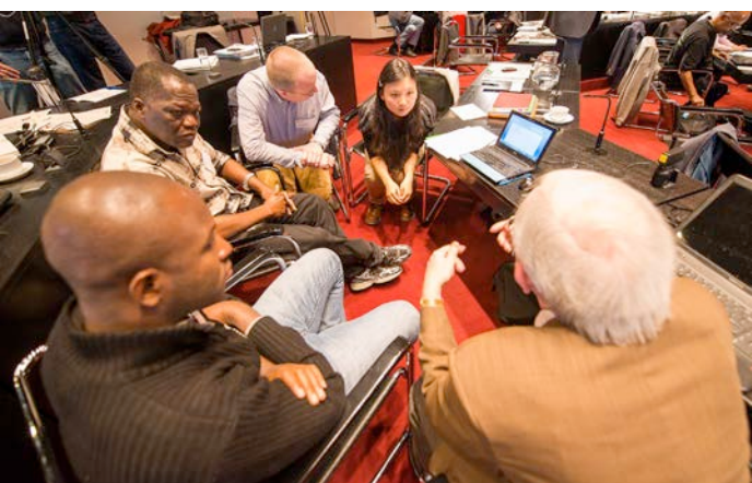
Small groups of participants in the discussion of interim results during the conference.